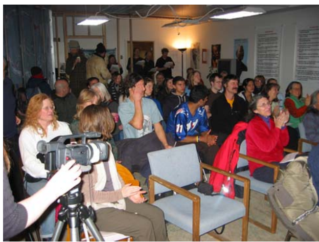
Audience Applauding the Puppet show on February 13, 2006