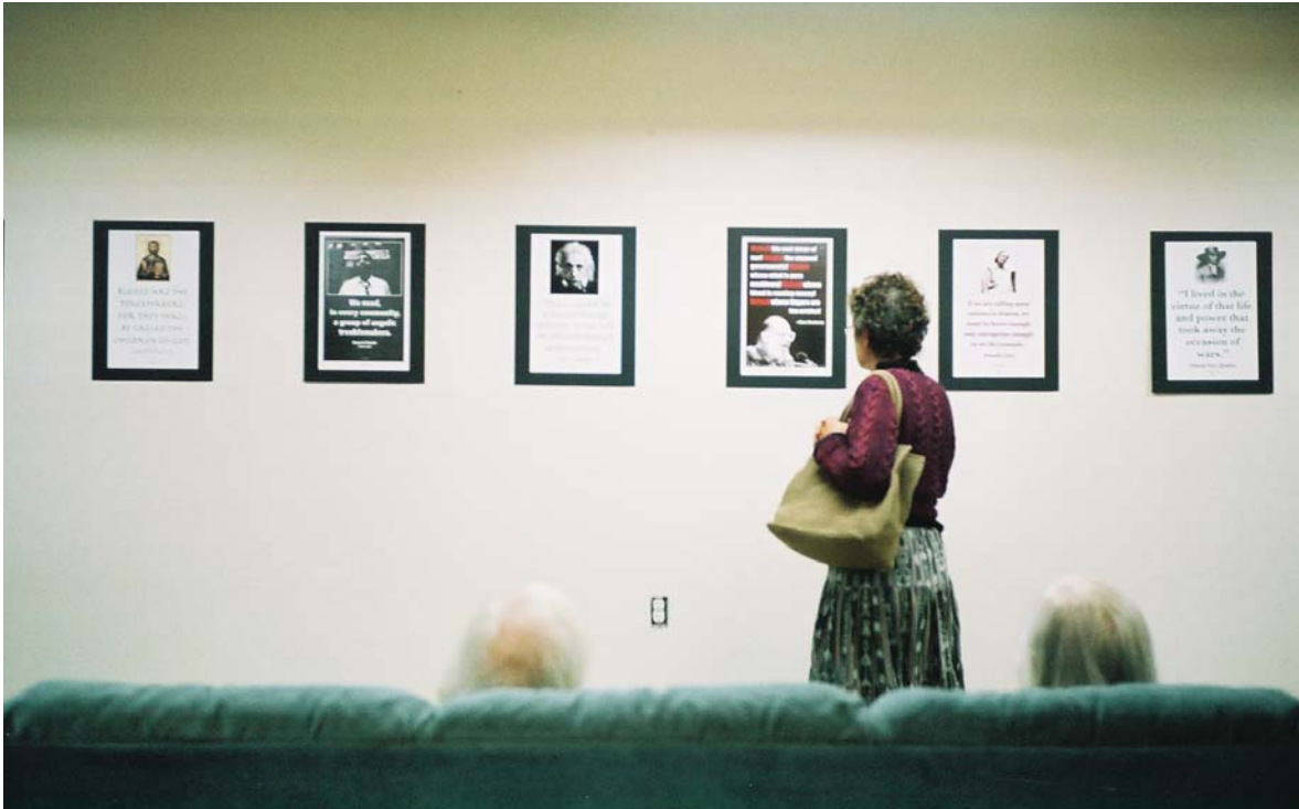
First Friday at the Alaska Peace Center, Exhibit of Peace Poster by artist Lester Doré