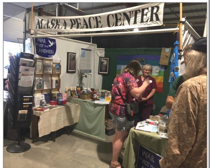
Alaska Peace Center booth at the Tanana Valley State Fair