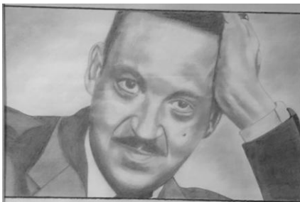
U.S. Supreme Court Justice Thurgood Marshall

I recently wrote to our Congressman asking him to support HR97 that would repeal the federal death penalty by simply removing the word "death" from federal sentencing laws. The Congressman thanked me for sharing my perspective and said, "I am a supporter of the death penalty and believe that any sentencing protest must be conducted on a case by case basis. The death penalty is a fitting punishment for those who have committed heinous crimes. It is also important, however, that we ensure that we do not put innocent people to death. The U.S. Constitution defines the circumstances under which the death penalty may be considered a sentencing option. The Eighth Amendment to the U.S. Constitution states that cruel and unusual punishments shall not be inflicted. On a per crime, case by case basis, a determination must be made whether this sentence would violate the citizen's constitutional rights."