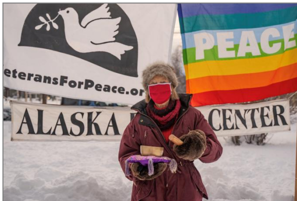
Prayers and Bells for Peace

Alaska Center, Alaskans FOR Wildlife, Alternatives to Violence Project/Hands of Peace, Defend the Sacred Alaska, Fairbanks Climate Action Coalition, Fox Spring, "FreeThePeople," GI Rights and Counter-Recruitment, International Friendship Day, Kids for Environmental Action, KWRK-LP radio, National Association for the Advancement of Colored People, Native Movement, Missing & Murdered Indigenous Women & Girls, Our Children's Trust, Raven for Broadband, Veterans For Peace, Who Decides Inc.