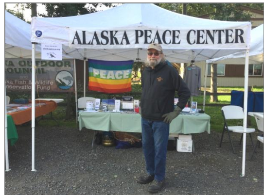
APC Booth at the Renewable Energy Fair