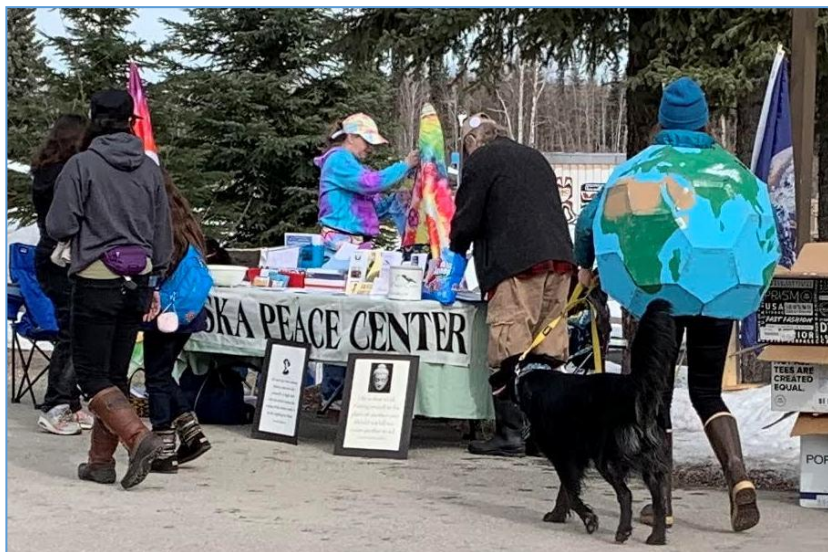
Earth Day at Alaskaland