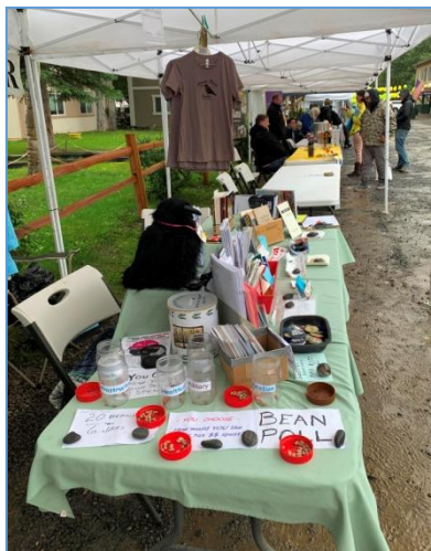
Bean Poll at Renewable Energy Fair