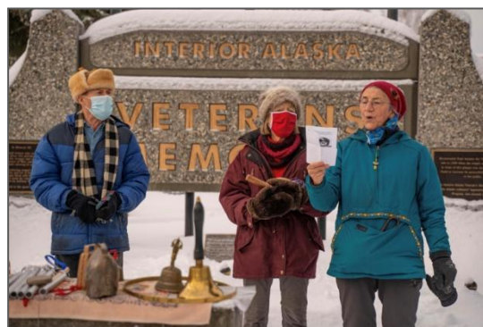
Armistice Day 2020