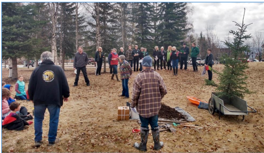
Arbor Day with Fairbanks Peace Choir