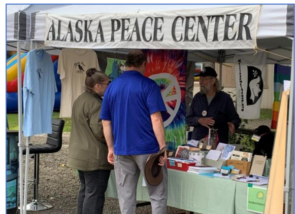
Renewable Energy Fair, at Chena Hot Springs, Aug 14 '22,

First Alaskans Tribunals, NAACP, Chena Tool Library, FCAC Renewable Energy and Interfaith WGs, Save Our Domes, FCNL, Roaming Root, ARK, Meals On Wheels, and KWRK-LP 90.9FM