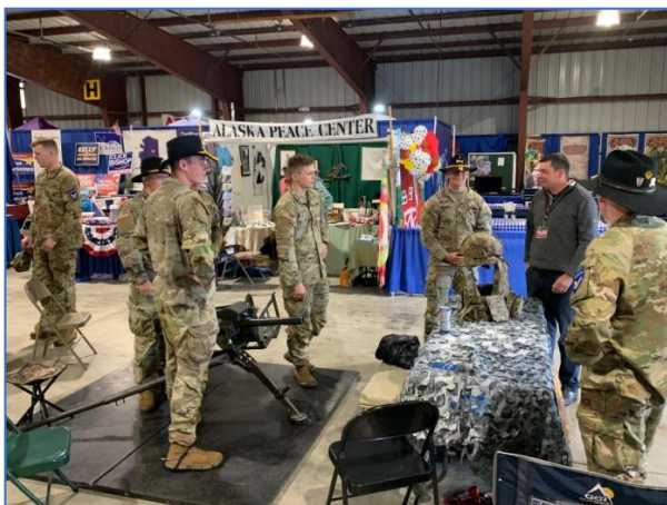
APC Booth at Tanana Valley State Fair, Jy 29-Aug 7 '22, during Military Appreciation Day