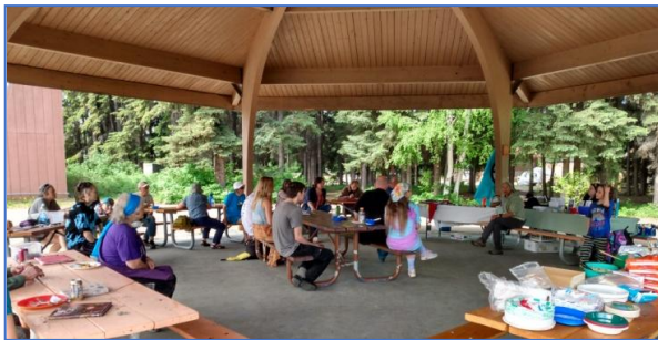
9th Annual Peace Feast, June 4 '22, presentations from:

First Alaskans Tribunals, NAACP, Chena Tool Library, FCAC Renewable Energy and Interfaith WGs, Save Our Domes, FCNL, Roaming Root, ARK, Meals On Wheels, and KWRK-LP 90.9FM