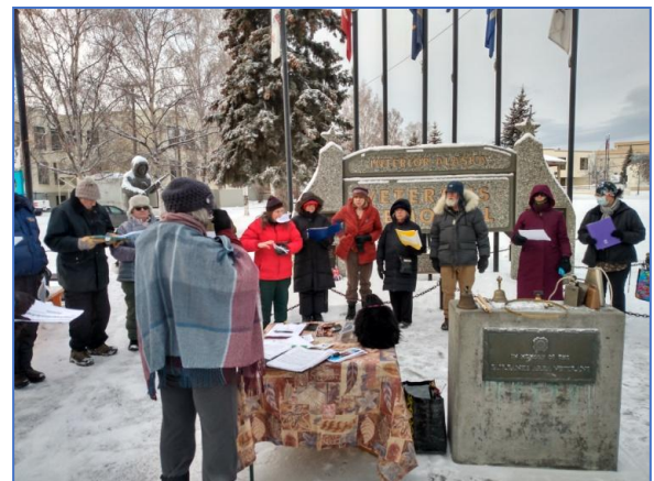
Armistice Day, November 11, 2022, with Fairbanks Peace Choir and Veterans For Peace, coverage by Fairbanks Daily News-Miner.