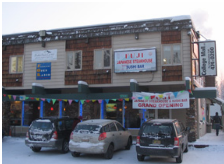
Alaska Peace Center office ste 203, 3535 College Rd, Fbks

Donate by mail to Alaska Peace Center 3535 College Road, Suite 203 Fairbanks, AK 99709-3722 or alaskapeace.org donate