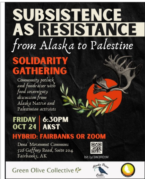
The flyer for a fall 2025 APC event