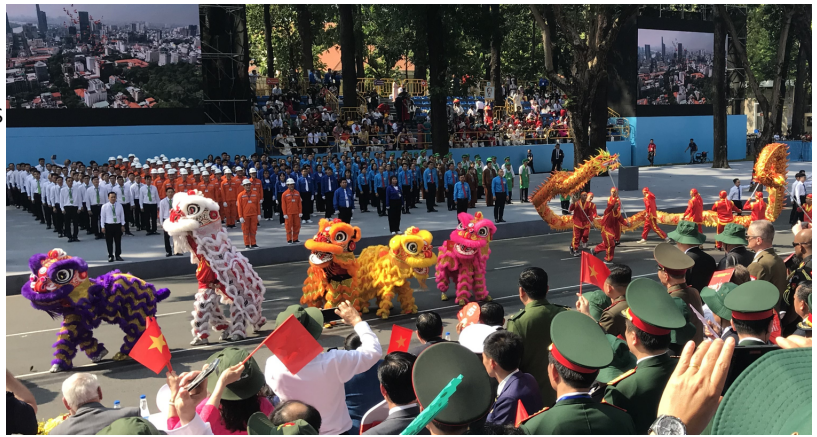
Reunification Day parade in Ho Chi Minh City

We were a little disappointed in the heavy military emphasis, but given Việt Nam's long history of fighting off invaders (most recently the Chinese in 1979) we could see the need for a strong military. We did feel sorry for the rows of troops across the street from us, standing at attention for hours in the hot sun. But aside from the long columns of marching troops there were many components celebrating the peace and industry that Việt Nam enjoys today.