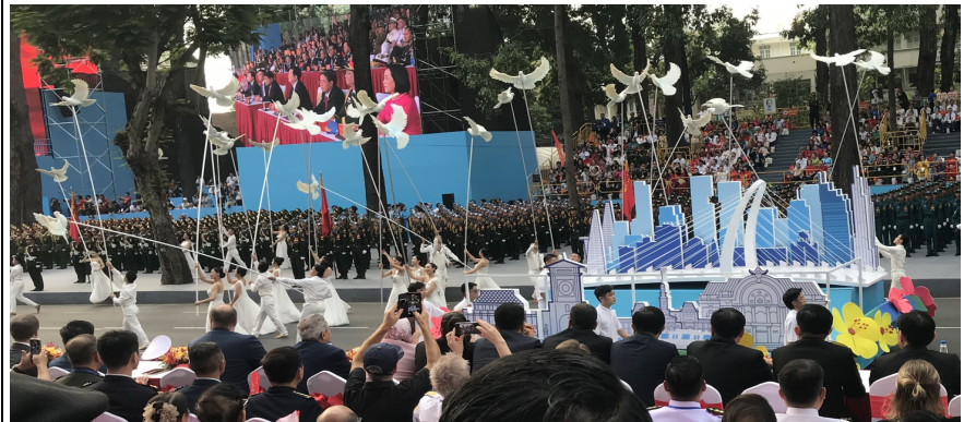
Reunification Day parade in Ho Chi Minh City

The evening before the big celebratory parade, the streets started filling up even more than before with people camping out on the sidewalks for the night. We had to board our bus at 5:00 in the morning to get to our assigned spot in the bleachers. The bus had to move very slowly and carefully to avoid running over sleeping people.